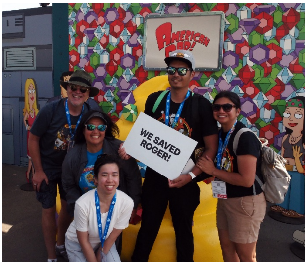
You wouldn't believe how hard alien physiology is.