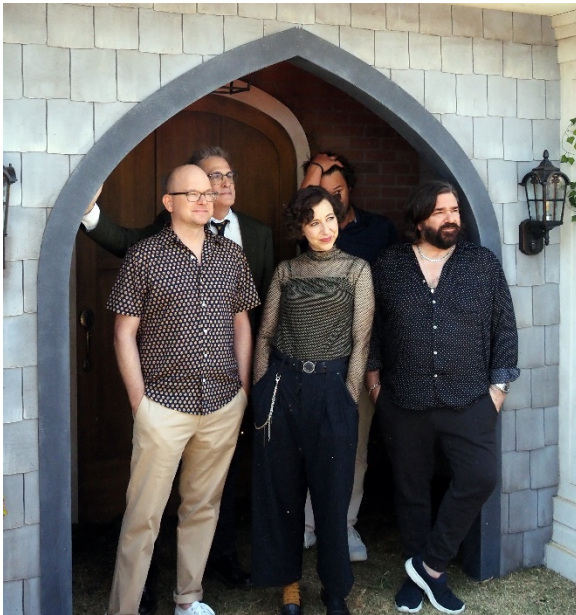
What we do in the light?