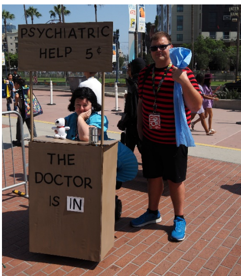
No free advice, blockhead!