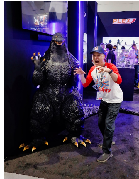
Believe it or not, that's a costume.