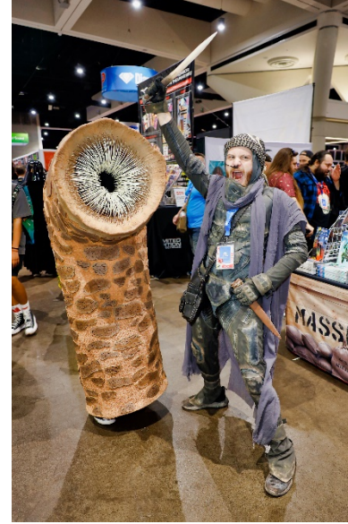
Yikes. Is that sandworm full of popcorn?