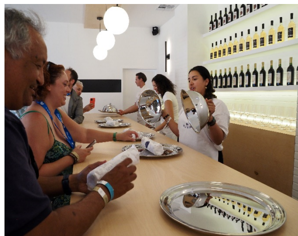
It's more than just cuisine served up at The Bear.