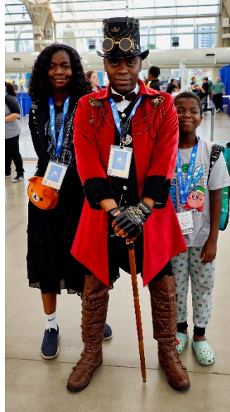
The family that Steampunks together, stays together.