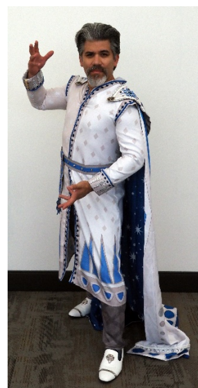
Enter El Magnifico!