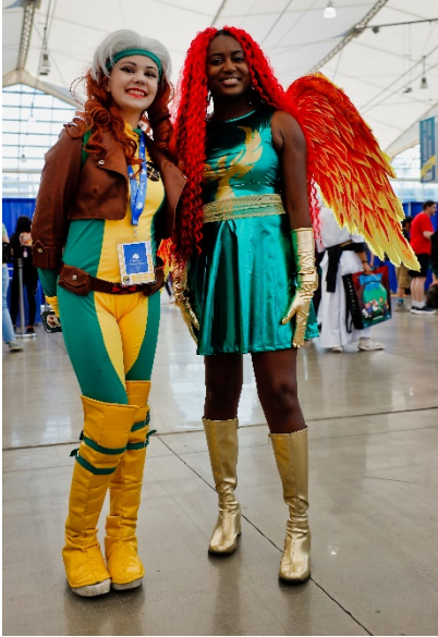
Who to trust? Rogue or Phoenix?