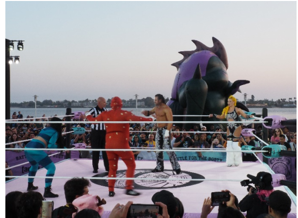
Thursday's Adult Swim "Battle for the Booty" was fierce!