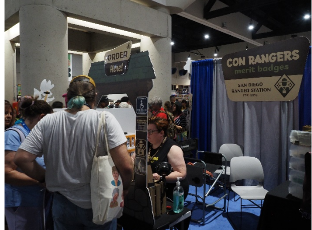
Merit badges for "Con"-ing? The Scouts would be proud.