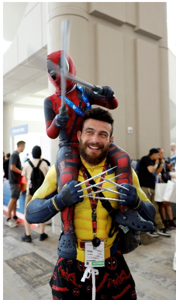
Two (re)generations of Wolverine and Deadpool!