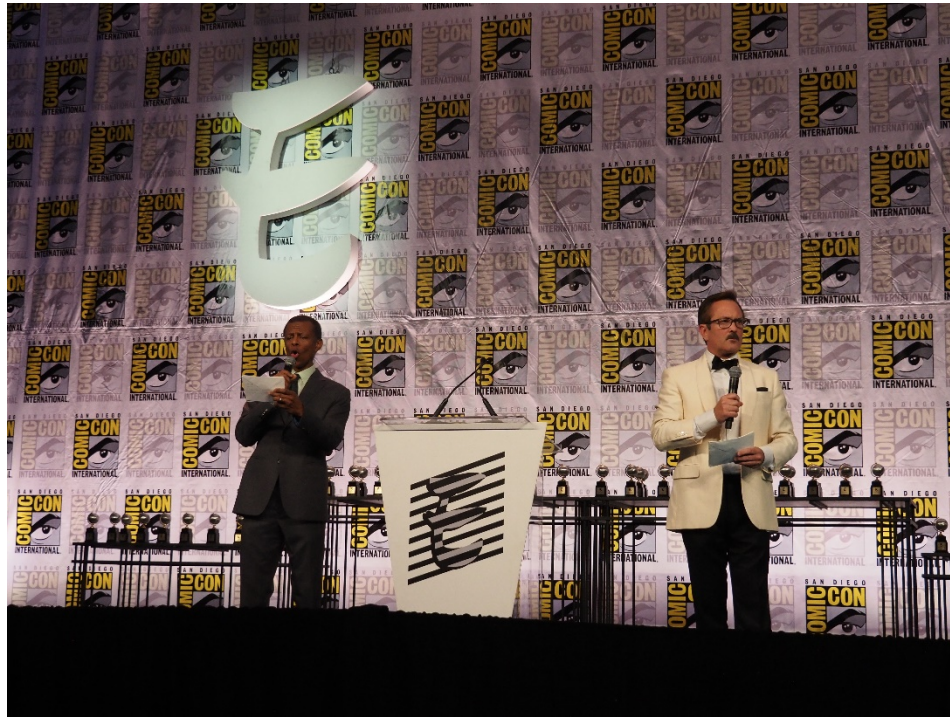
2024 Eisner hosts Phil LaMarr and Tom Lennon serenade the audience