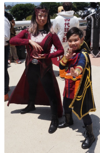
A family not to be trifled with!