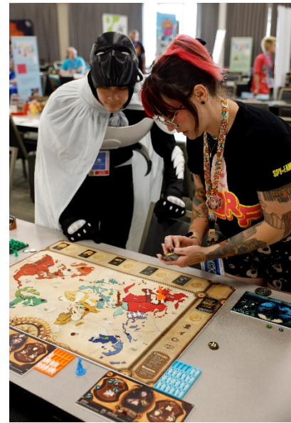
That game looks a little bit complicated.