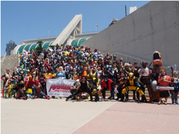
A "Marvel"-ous turnout.