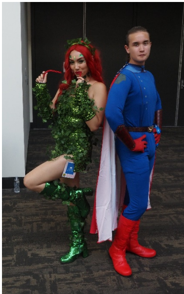
Ivy and Homelander, together? Talk about a crossover!