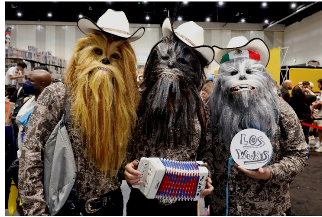
The sweet intergalactic sounds of "Los Wukis".