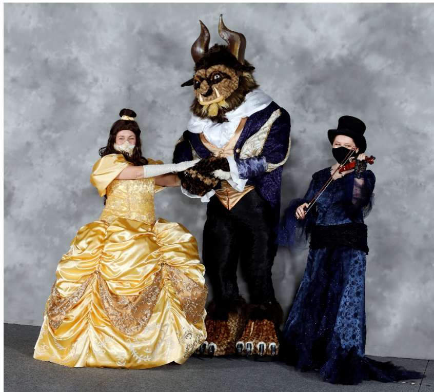
A tale as old as time, Judges' Choice Award winner from Comic-Con Special Edition, 2021