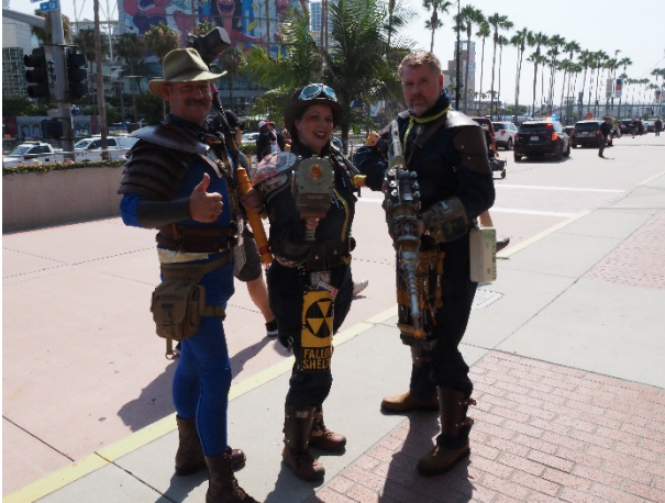
Nice to see Fallout survivors around this year.