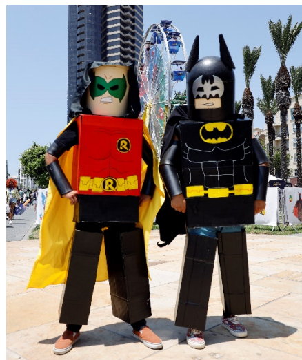
Impressive (and homemade)!