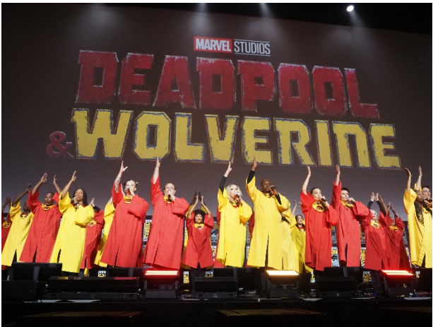
Like a prayer for DP and the Wolverine!