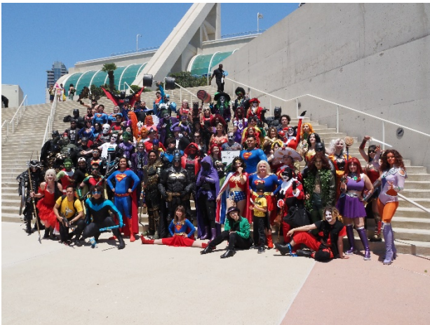
DC in SD