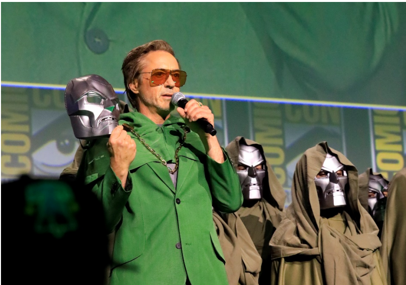
Robert Downey, Jr., announced as Dr. Doom