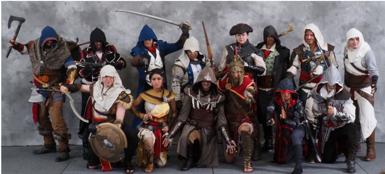
Assassin's Creed Brotherhood – Best of Show