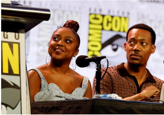
Quinta Brunson and Tyler James Williams of Abbott Elementary