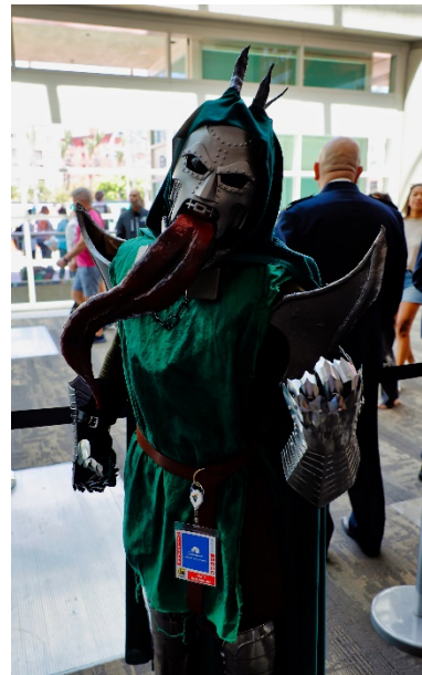
They call me Dr. Doom of Love