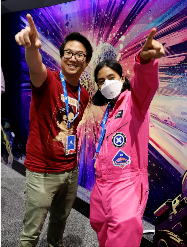
NASA – To infinity and beyond