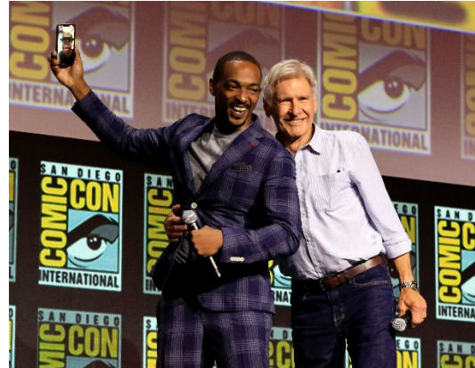
Anthony Mackie and Harrison Ford on Marvel panel