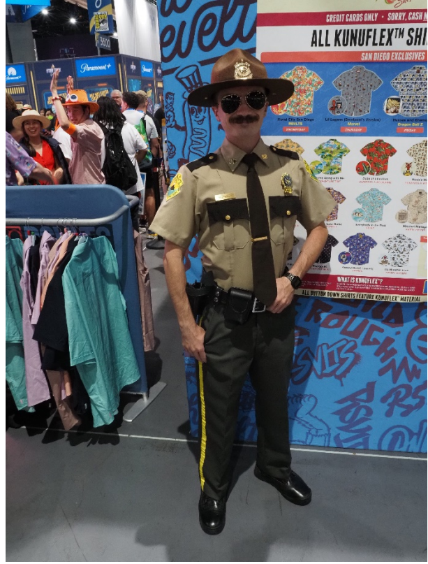
Meow, what seems to be the problem here?